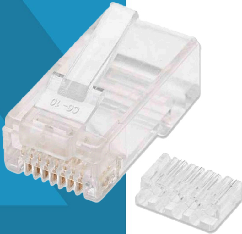
CAT.6 UTP PLUG AR-3326